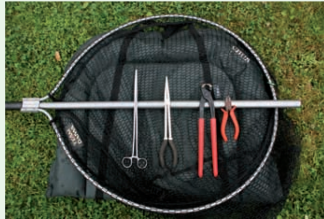
Large net, unhooking mat, forceps, pliers and wire cutters are all essential tools for handling/release of pike.

There are a number of basic precautions the angler can take during an angling session, which will help minimise damage/stress to pike. Firstly, a proper form of bite indication should be used which enables the angler to detect bites early. While deadbaiting, floats & bite indicators are an aid, but it is imperative that the angler pays attention to them and does not wander too far from the rods. Secondly, a suitable landing area should