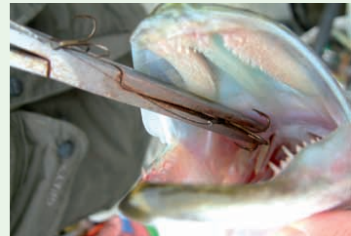
With deeply hooked pike, an artery forceps should be used.

Pike are built for short sharp bursts of energy and so from the moment they are hooked they expend their energy quite rapidly. As pike are not used to prolonged periods of exertion, playing puts them through great strain and so every effort should be made to land the fish quickly. This is particularly relevant during the summer months when oxygen levels in the water are low. One exception is when a pike is hooked from a deep lie (25ft/7.5m). In this case the fish should be brought slowly up to the surface to allow it to adjust to the change in water pressure and thus avoid gassing. A strong rod coupled with strong line will help to bring the fish in quickly. A longer rod will give better control when seeking to avoid snags such as weed. Once tired, the pike may be unhooked in the water (lure or fly fishing), or else it should be drawn in over a large landing net. Choose a rubber landing net that is resistant to tangling with treble hooks.