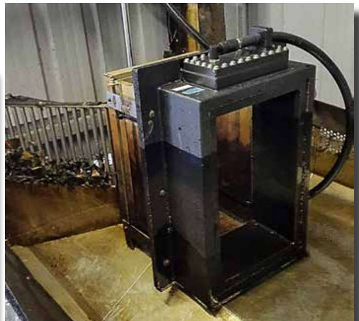
PIT Tag Reader at Aasleagh Falls Trap