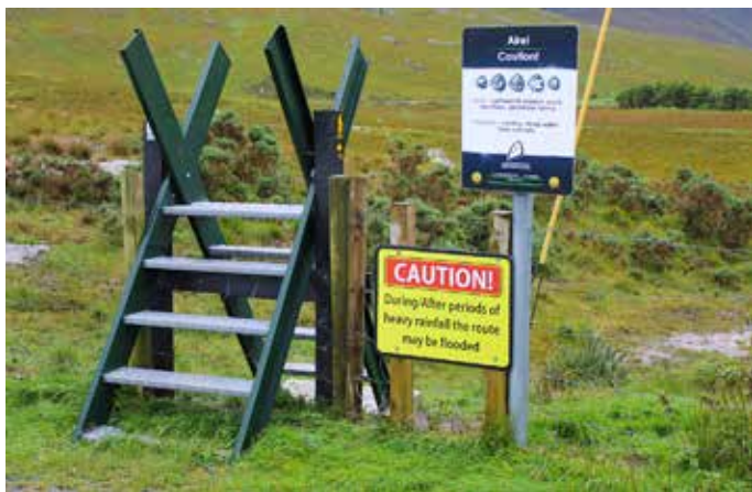
New stiles made from aluminium (top) and recycled plastic (bottom).

The continued upgrade of our Stiles and footbridges from old wooden structures to new aluminium and recycled plastic ones was on going throughout the year along with bank restoration and general maintenance of the fishery. New signage was also put in place along the fishery drawing attention to the possible hazards to anglers and the general public.